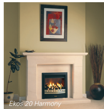
Ekos 20 Harmony

For more information on Burley products please phone Burley on 01572 756956, visit www.burley.co.uk or see our facebook page.